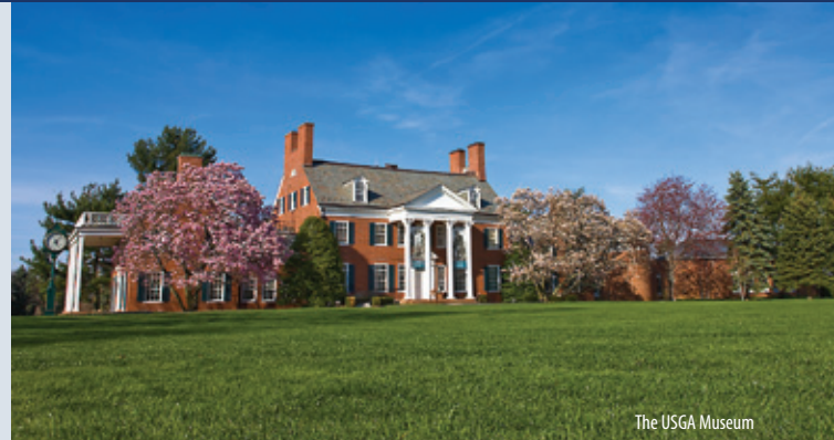
The USGA Museum