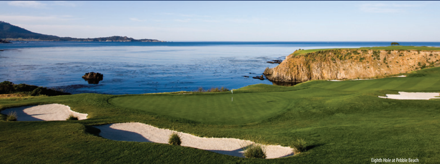
Eighth Hole at Pebble Beach