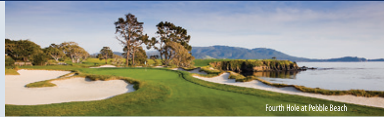
Fourth Hole at Pebble Beach

Since the Main Merchandise Pavilion, Satellite Merchandise Tent and The Lodge Retail Arcade are located on the championship grounds, you must have a U.S. Open ticket or credential to gain entry during championship week.