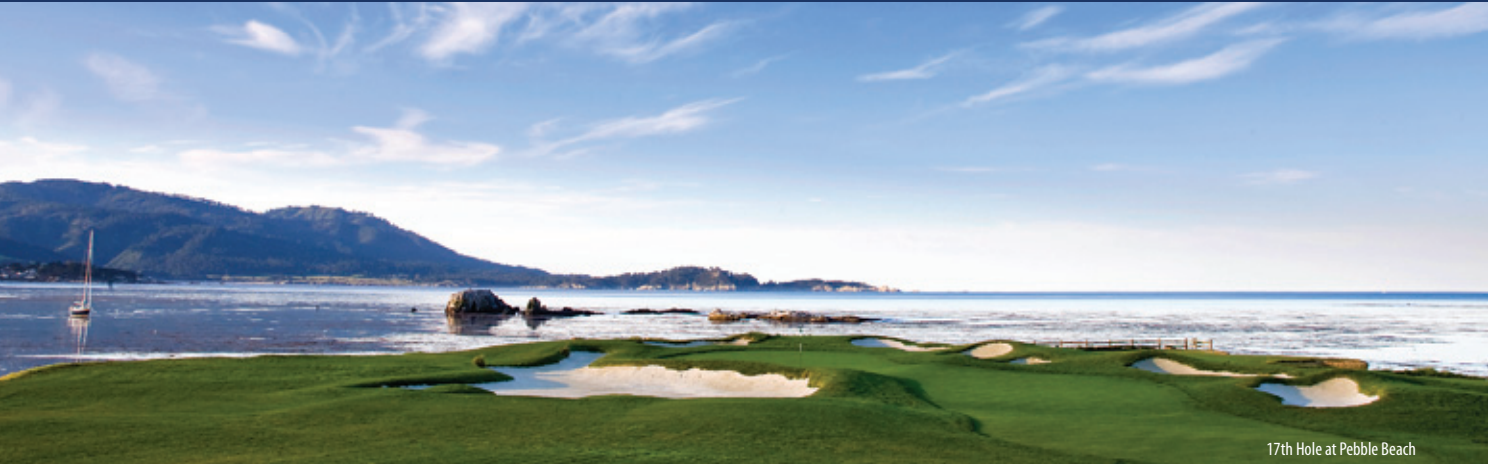
17th Hole at Pebble Beach